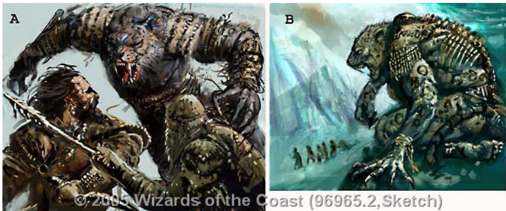
Arctic Nishoba sketch by Dave Kendall

Dave has created a nice and ominous scene, showing the nishoba lurking on a high ice ridge, scouting the movements of arctic passersby. The creative team wanted to show more clothing and armor on the nishoba—this is a vicious combatant but also a sentient creature.